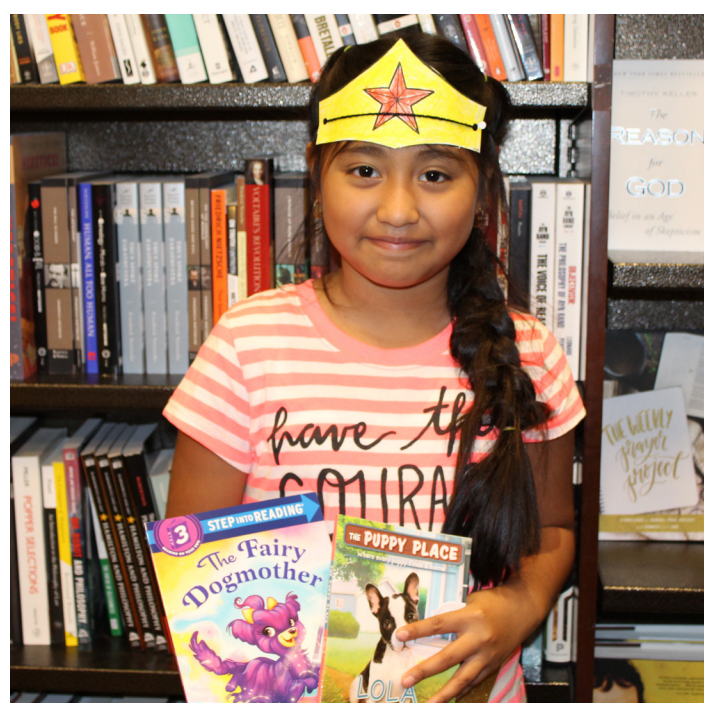
A student from the YMCA of Western Monmouth County receives free books as part of United Way's summer literacy program.

United Way of Monmouth and Ocean Counties worked with the following partners in order to make the summer