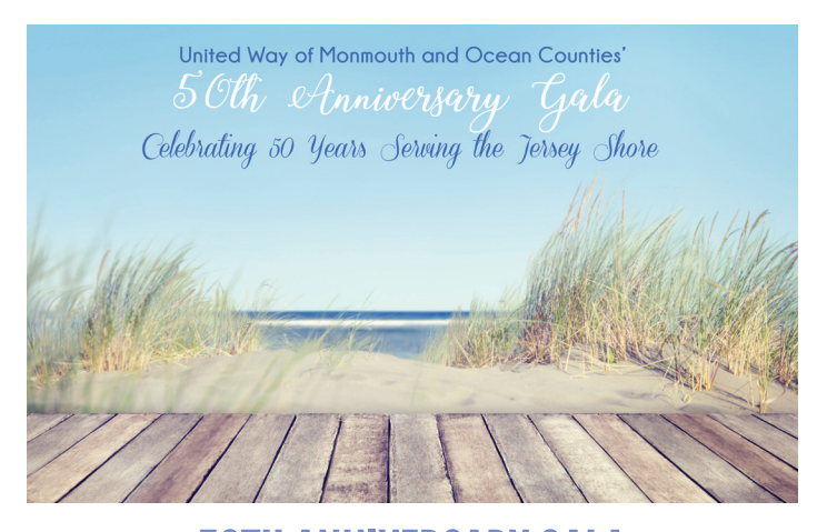
50TH ANNIVERSARY GALA Friday, April 20, 2018 Eagle Oaks Golf and Country Club in Farmingdale