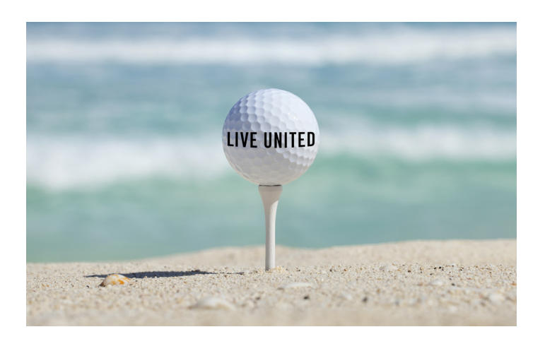
2018 SPRING TEE-OFF Monday, May 21, 2018 Hollywood Golf Club in Deal