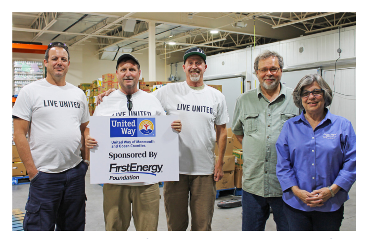
JCP&L employees sorted food and stocked the shelves at Fulfill on behalf of UWMOC's Day of Action.

United Ways around the nation hold an annual Day of Action on June 21 where we ask our friends, family and valued business partners to join us in improving lives and conditions in our community. This past June, UWMOC was joined by dozens of employees from L'Oréal, Exelon Generating, JCP&L and Cowan, Gunteski & Co., P.A. Our volunteers worked tirelessly to assist with painting a warehouse for Holiday Express, repairing picnic tables and power washing playground equipment for Head Start, harvesting sweet potatoes at Collier Youth Services, stocking the shelves at Fulfill and Lunch Break, and clearing trails at a Boy Scouts camp. We also held a Red Cross blood drive at the Ocean County YMCA while volunteers worked to beautify the building's entryway. This Day of Action, 85 volunteers spent 340 hours making a difference in our community.