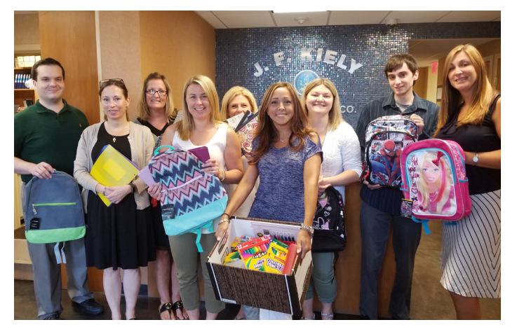
Stuff the Bus sponsor J.F. Kiely Construction Co. collected over 300 items for the school supplies drive to benefit local students.

Each summer, our Stuff the Bus drive collects essential school supplies for students throughout our community, ensuring that they begin the school year with the tools they need to succeed. Sponsored by J.F. Kiely Construction Co. and New Jersey Natural Gas, the 2017 drive had an incredible outpouring of support. Five events were held at Walmart and Wegmans stores in Monmouth and Ocean