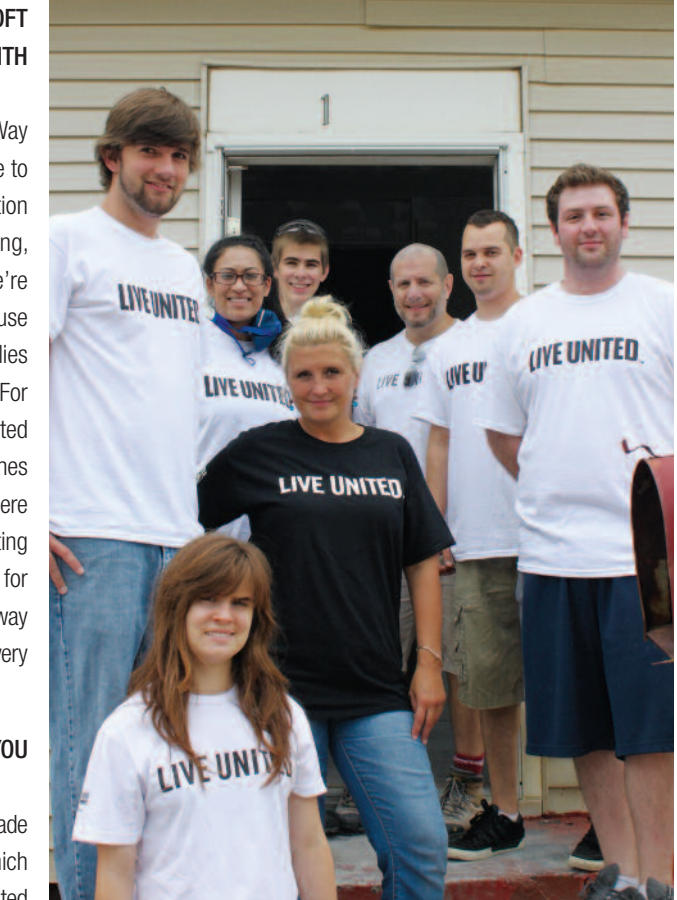
SINCE SUPERSTORM SANDY, MICROSOFT EMPLOYEES HAVE PARTNERED WITH UNITED WAY OF MONMOUTH COUNTY TO VOLUNTEER FOR "DAYS OF CARING." HELPING TO RESTORE HOMES IN SHORE TOWNS HARDEST HIT BY THE STORM.

To learn more about volunteer opportunities, please visit uwmonmouth.org/volunteer or contact us at 848-206-2042 or volunteer@uwmonmouth.org. To donate to United Way of Monmouth County, please visit uwmonmouth.org/give.