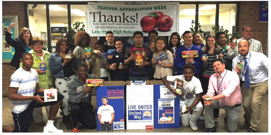
Above: Students at Lakewood High School help collect perishable food for our annual Spring Food Drive. Right: Our staff members get boxed in by all of the food donated by the MATES school in Manahawkin.

Every year, as the supplies from holiday food drives dwindle, food pantries see empty shelves. That's where the United Way of Ocean County steps in. Last April, our team worked with over 20 businesses and organizations to help stock food pantries, resulting in the donation of several thousand pounds of food and in-kind support worth $22,600.