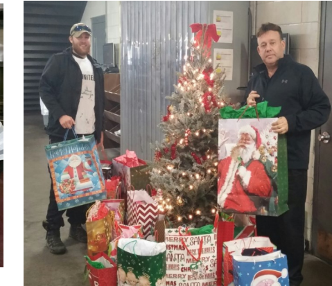
Above clockwise: Elves from Exelon Oyster Creek, UPS and Boscov's, all gathered to help collect toys for the neediest children in Ocean County.