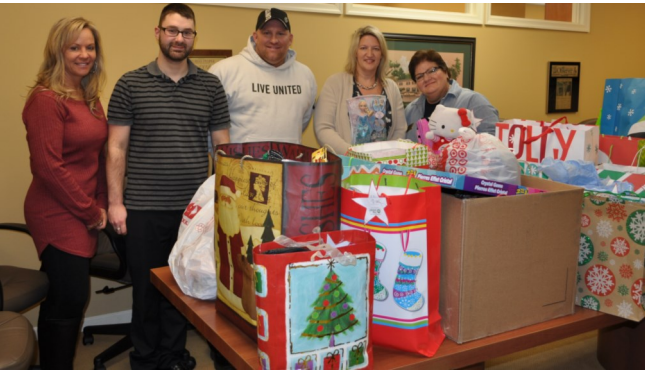
The employees at Nitto Denko Automotive, New Jersey, Inc. donated toys to the families at Dottie's House.