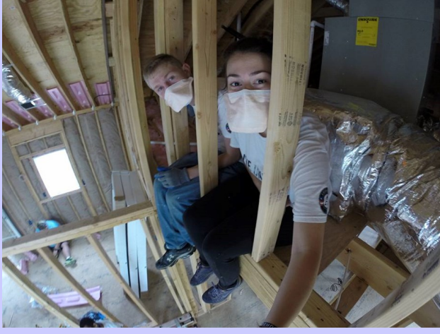
Summer of Service AmeriCorps members

Ocean County's ReBuild NJ AmeriCorps program began installing the insulation and drywall in attempts to remain on schedule for their August completion date.