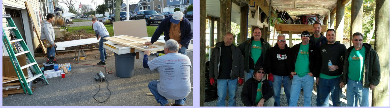
Six Flags Great Adventure & Safari and Hurricane Harbor employees joined us for our last corporate build day. The volunteers split up into three different locations in Pt. Pleasant, Manahawkin and Toms River. As we close out our Sandy projects, we are happy to share this last project with such fantastic volunteers.

Give. Advocate. Volunteer. is our motto and is what we do here at the United Way.