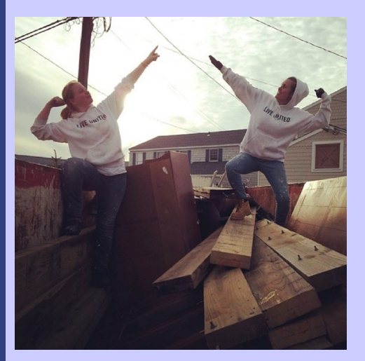
AmeriCorps members take a moment to celebrate a job well-done!