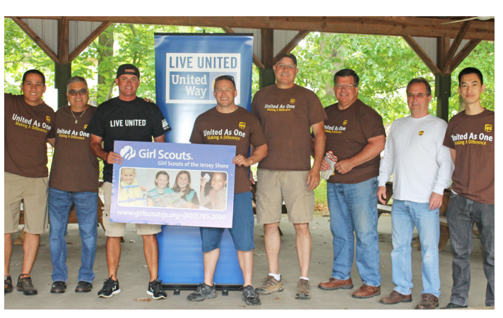
UPS employees spent a Day of Caring volunteering at Girl Scouts of the Jersey Shore's Camp Sacajawea getting it ready for the summer.

Thank you to UPS for your hard work and dedication in delivering goodwill to our community!