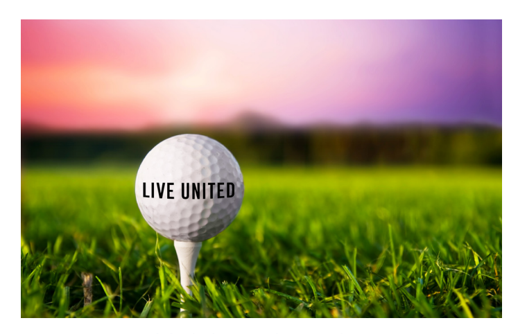
2019 SPRING TEE-OFF Monday, May 20, 2019 Hollywood Golf Club in Deal, NJ