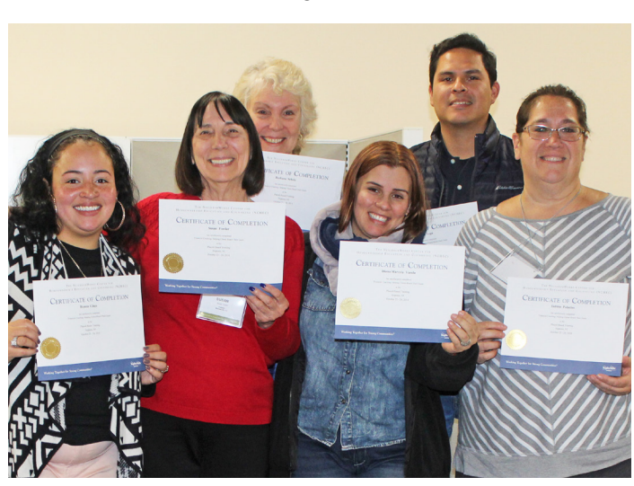
In partnership with Affordable Housing Alliance, UWMOC provided free NeighborWorks America training sessions to 30 nonprofit employees. Pictured above, employees of Fulfill received their NCHEC certification in Financial Capability to better serve our community.

For a full list of services, locations and more information, visit uwfinancialsuccess.org.