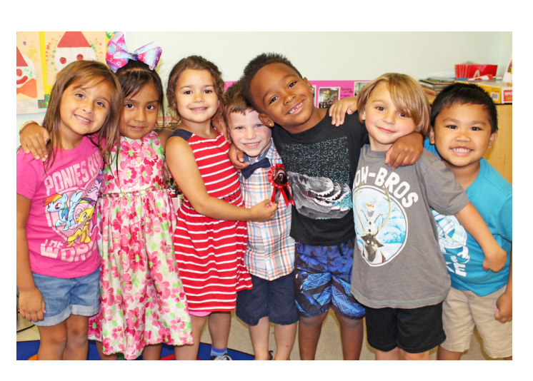
Students in the summer literacy program hosted by UWMOC's partner O.C.E.A.N. Inc. in Toms River.

practices and challenges in order to strengthen the program for Summer 2020.