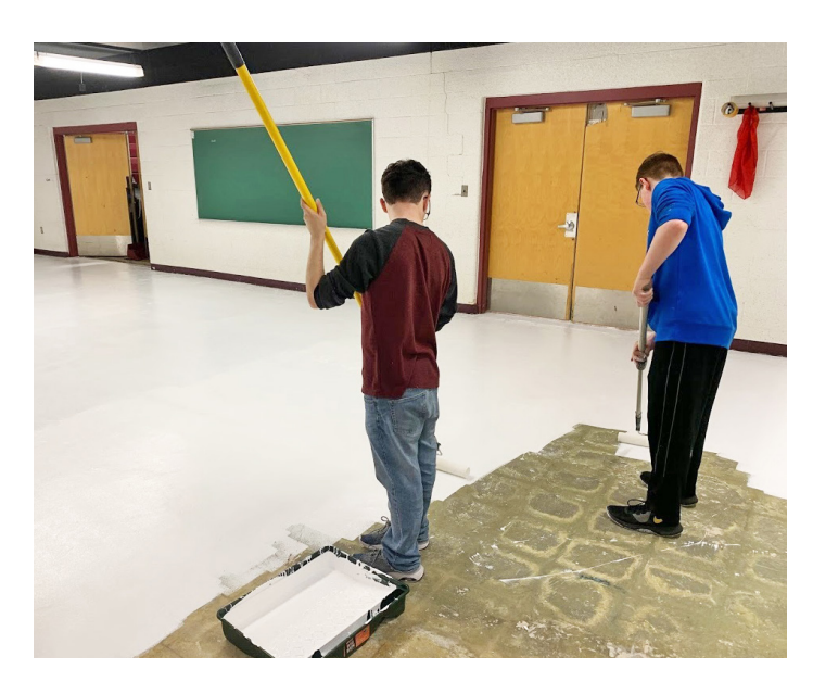
Students in Project SPEAR-IT worked hard to prepare the space in Toms River High School South that will host the program.

dropout rates. As part of the grant from UWMOC, HSS will remodel a space that is dedicated to the program, and facilitate at least 10 field experiences for students. The grand opening of the remodeled classroom will be announced this year, and we welcome the community's involvement in celebrating this new and exciting initiative.