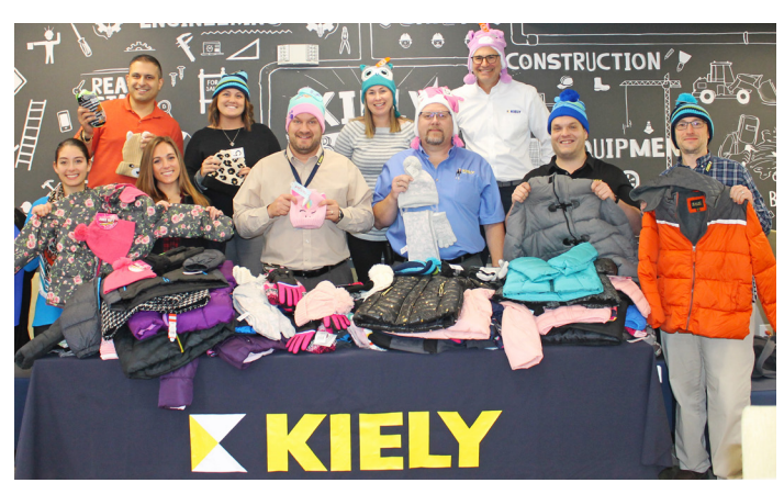
J.F. Kiely Construction Co. employees donated over 160 new coats and winter outerwear to the 2019 Warmest Wishes Coat Drive.

Thank you to J.F. Kiely Construction Co. for your hard work and dedication in delivering goodwill to our community!