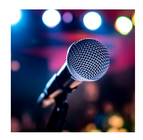
KORONA KARAOKE VIRTUAL EVENT TO BENEFIT UWMOC Fall 2021