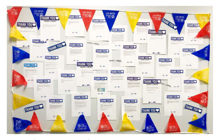
A wall of thank you letters for everyday heroes created by New Jersey Natural Gas employees for the United in Gratitude project.

New Jersey Natural Gas employees and other individuals thoughtfully wrote more than 45 letters which were given to our local heroes at health care facilities and fire stations to lift their spirits.