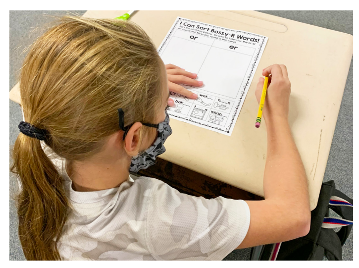
A student doing classwork in the Extended Day Program at Cedar Grove Elementary in Toms River, funded by the UWMOC COVID-19 Recovery Fund.

UWMOC also supported the efforts of NJ 2-1-1, a health and human services hotline with critical resources for all residents of New Jersey, particularly those affected by COVID-19. The grant helped expand their staff and resources to handle the increased call volume, which more than doubled since the start of the pandemic. As of December 2020, NJ 2-1-1 had assisted over 27,000 residents of Monmouth and Ocean counties with immediate needs during this crisis.