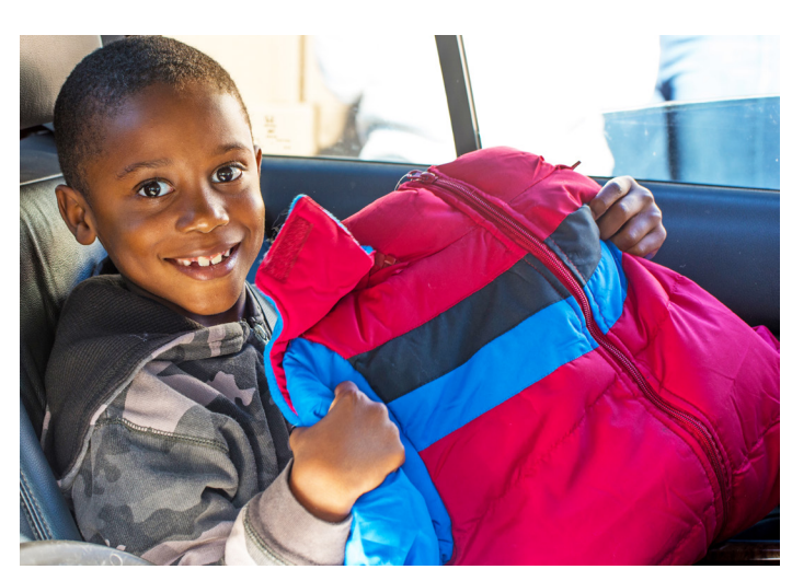
One of the happy recipients of a new coat from Operation Warm Up Jersey Shore.

Over two days in November 2020, hundreds of families attended drive-through events at Fulfill in Neptune and the Church of Grace and Peace in Toms River. Both events were organized and carried out by the distribution partner, Fulfill, which also provided each household with a meal kit. UWMOC board members, community volunteers, and partner staff packed the meal kits and loaded them along with coats into participants' vehicles on each event day.