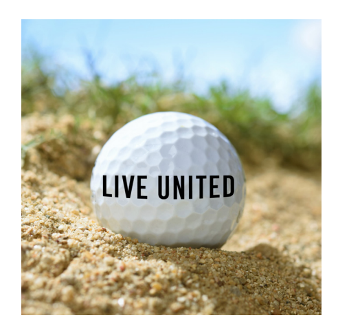
2021 ANNUAL TEE-OFF Monday, May 17, 2021 Hollywood Golf Club in Deal, NJ