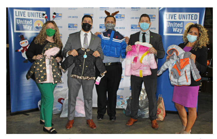
Representatives from TD Banks in Ocean County with some of their generous coat donations.