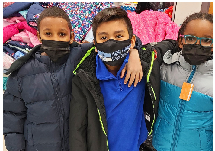
A group of friends from an Asbury Park elementary school enjoying their new winter coats.

With the continued growth of the drive and in honor of its 10th anniversary, UWMOC will be kicking off the 2022 Warmest Wishes Coat Drive on August 25, 2022 at the Jersey Shore BlueClaws stadium in Lakewood. More details to come!