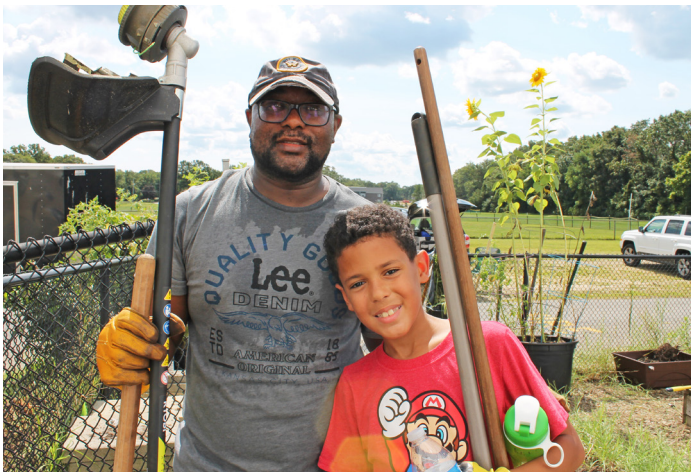
Volunteers at the 9/11 Day of Service volunteer project overhauled the community garden at Ocean County YMCA in Toms River.

In honor of September 11th and the victims, survivors and those who rose up in service, we turn tragedy into good by volunteering. UWMOC hosted a 9/11 National Day of Service volunteer project with our partner Ocean County YMCA. The McCormick Spice/Brand Aromatics team, their families and community members came together to completely overhaul the YMCA's community garden. One volunteer with plumbing experience was also able to install an outside water source to make it much easier to water the garden. In conjunction with 9/11 acts of kindness, volunteers painted kindness rocks to uplift the spirits of those who work in the garden.