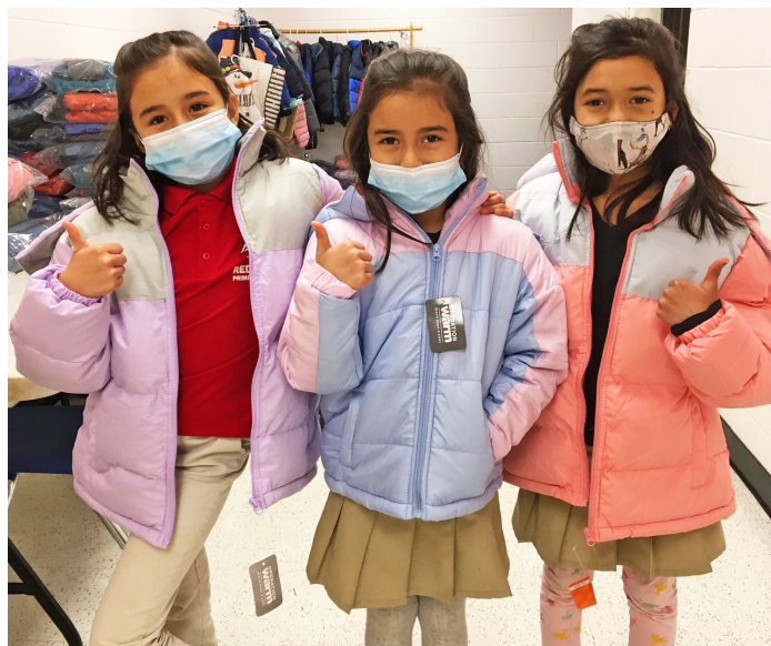
Students from Red Bank Primary School give a thumbs up for their brand-new coats from the Warmest Wishes Coat Drive.