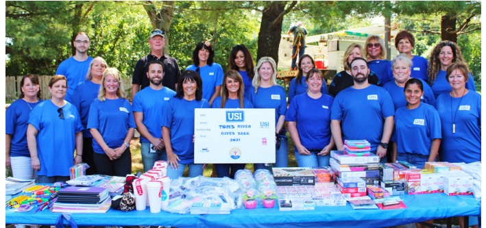
Employees from USI Affinity in Toms River collected items and volunteered their time to pack over 100 Senior Comfort Bags.

The Senior Comfort Bags are distributed to senior citizens throughout Ocean and Monmouth counties through our partnerships with the Meals on Wheels program. Thanks to the generosity of local organizations and individuals, over 430 residents have received a Senior Comfort Bag that has brought them some happiness during this difficult time.